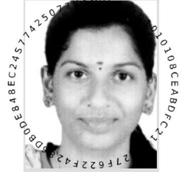
Photo ID Submitted Aadhaar ID (Number : 976691720127)