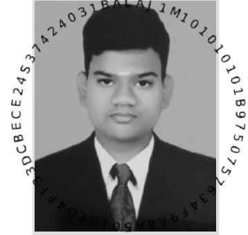
Photo ID Submitted Aadhaar ID (Number : 472974560363)