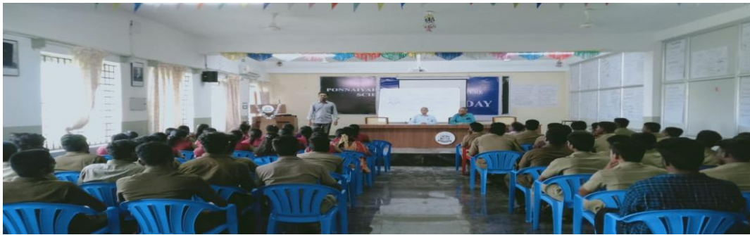
The Election Thasildar delivered the lecture on importance of democracy