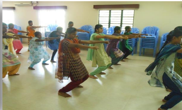
Yoga practice – students