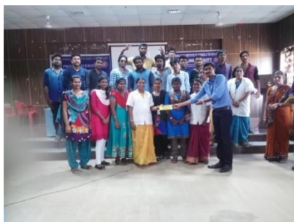
d. Prize distribution