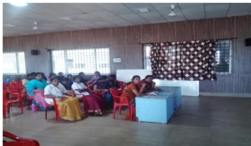
b. Participant leasing