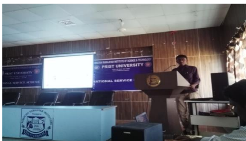
a. Technical speech