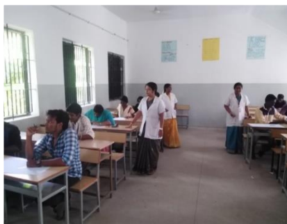
C. Students are participated the drawing

Event Name: Water Resources Awareness Programme