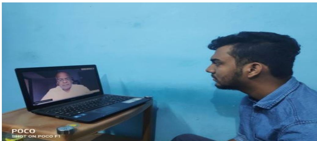
Yoga practices - Respiration