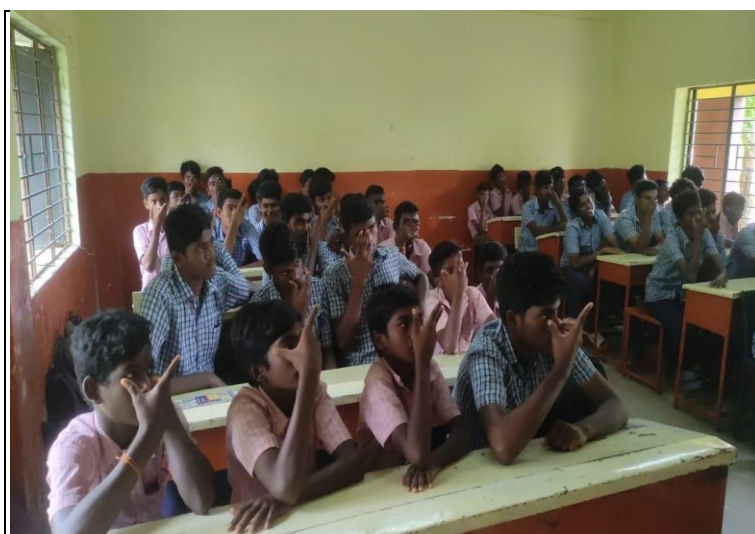
Students practice on respiration

NSS Programme Officer educated and created awareness about a very important disease that has been declared as a Pandemic by WHO- Corona virus disease (COVID 19) among the 125 NSS volunteers and NSS Programme Officers of our University. Awareness programme was conducted on 09.03.2022. Awareness was created regarding risk factors, high risk areas, symptoms, signs, diagnosis, treatment, complications, and most importantly the methods of prevention and precautions to be taken to safeguard oneself. The myths created on social media were also busted. They were made aware about the importance of using masks, the people at high risk who require the use of masks and that not everybody needs to wear a mask. They were also told that panic will not help in any way, but being aware of the problem, taking up the responsibility of creating awareness to peers and other family members to tackle the situation, approaching the healthcare providers and hospitals in case of any suspicion, is the key to control such a pandemic. Hand hygiene and its importance were also discussed. The programme continued till around 3:45 pm, followed by questions and answers session for the student volunteers and teachers/POs to clarify any doubts. The students enthusiastically participated in this discussion and asked their queries which were answered.