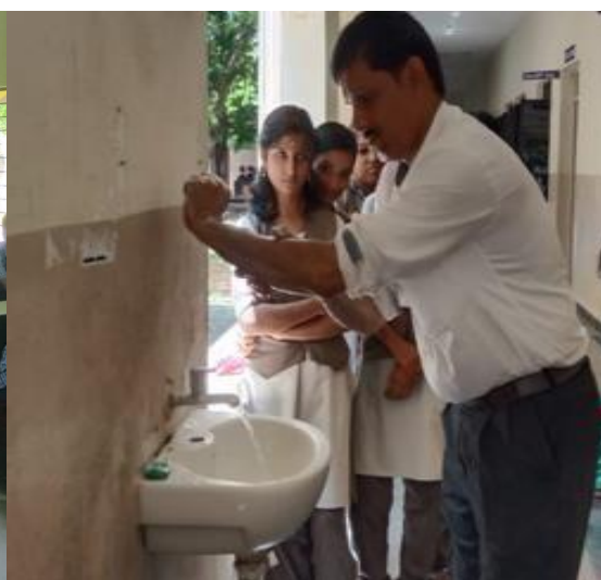
Demo for proper Hand cleaning