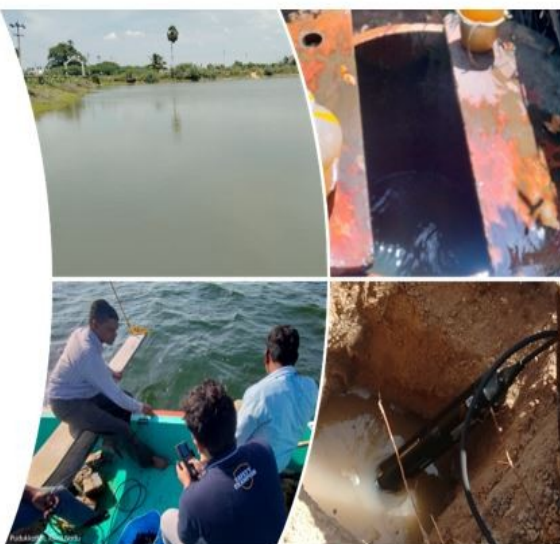
Fig-1 : Offshore thermal/salinity anomaly assessment

ISRO has awarded PRIST a project on ‘Subsurface tracking of groundwater discharge along coastal stretches of Andhra Pradesh and Tamil Nadu based on understanding and modelling of coastal aquifer dynamics’.