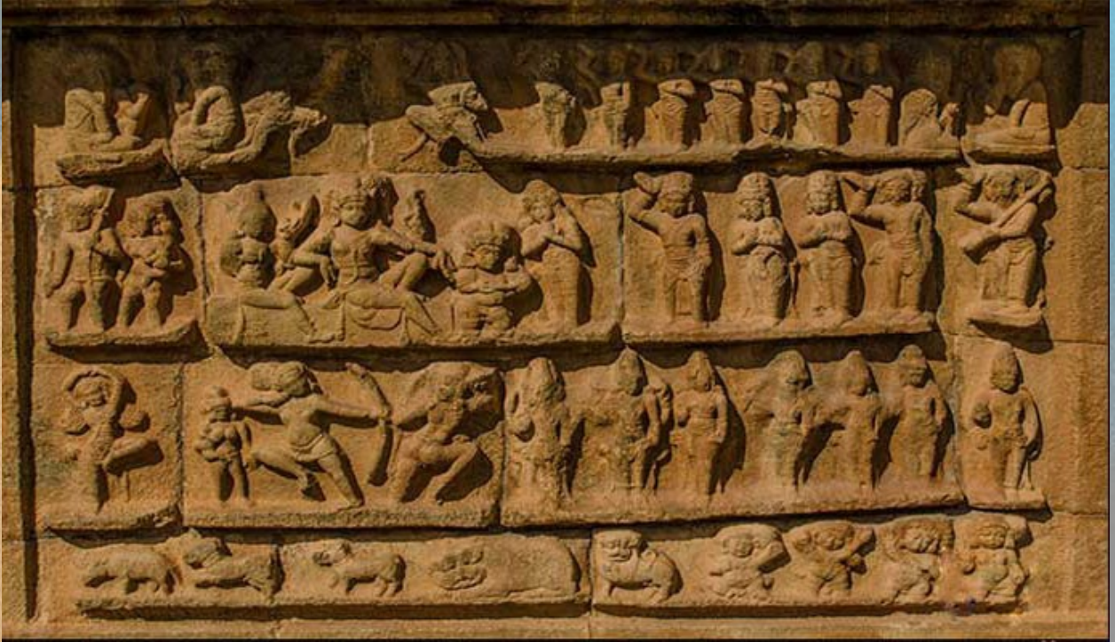
Pragadeeswarar temple sculptures