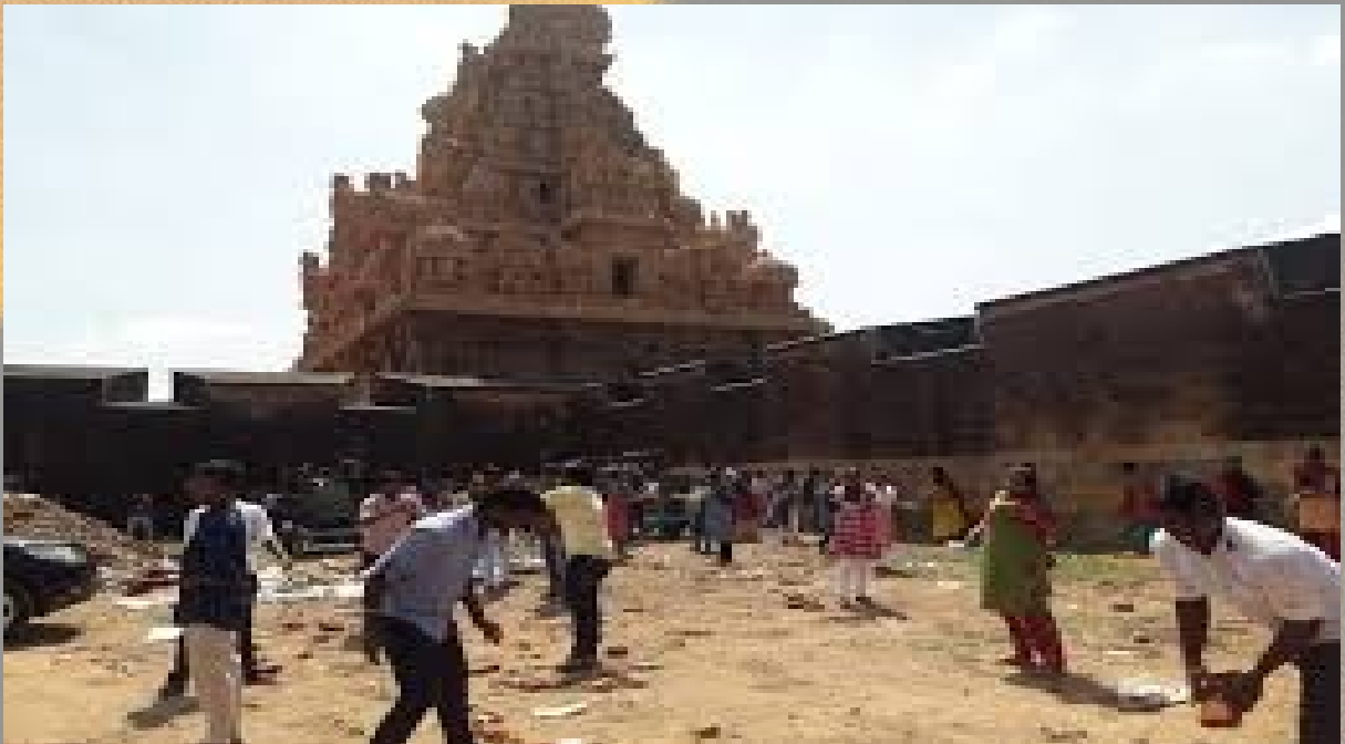
Pragadeeswarar temple – Thanjavur Indian Knowledge System (IKS)