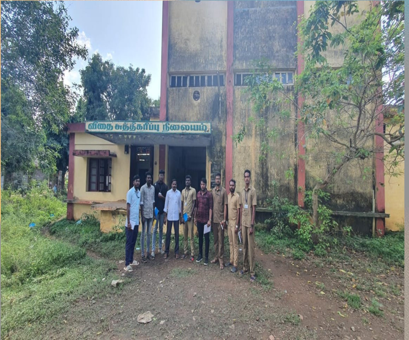
Seed Treatment Station