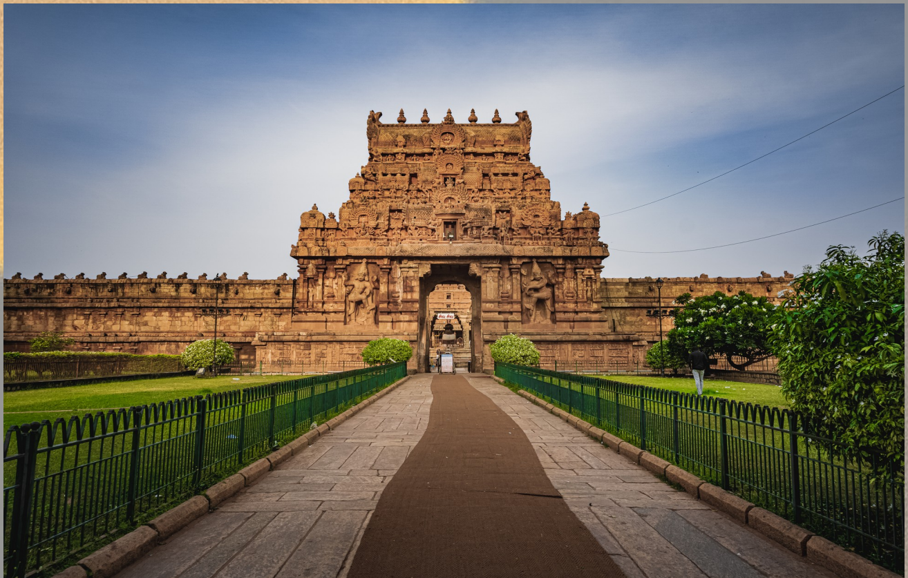
Pragadeeswarar temple -Indian Knowledge System (IKS)

Emphasises on the promotion of IKS. PRIST has, in this connection, a distinctive advantage. Faculty members organize periodically visits to the historical monuments present in the vicinity of the campus. Some of these monuments include, Pragadeeswarar temple, Thiruvaiyaru Thiagaraja memorial place etc.. The IKS aspects advocated in the new educational policy are addressed by such planned educational visits of various groups of students