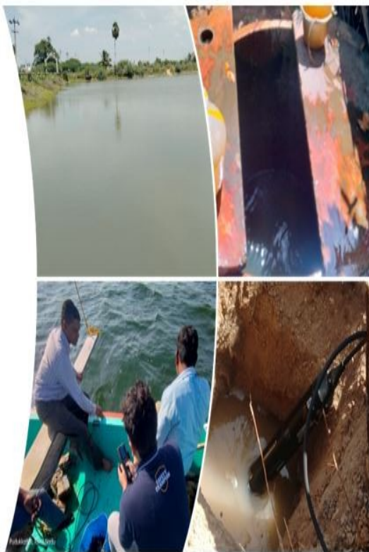
Fig-1 : Offshore thermal/salinity anomaly assessment