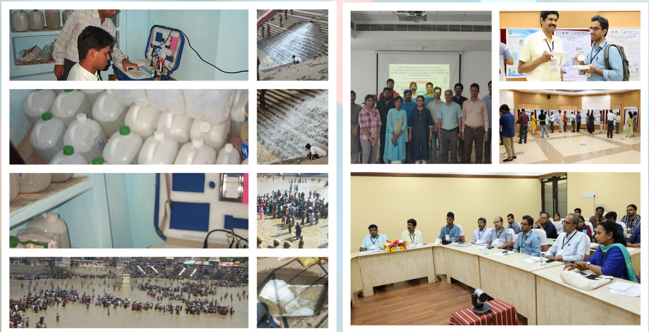
Mahamaham tank - water quality